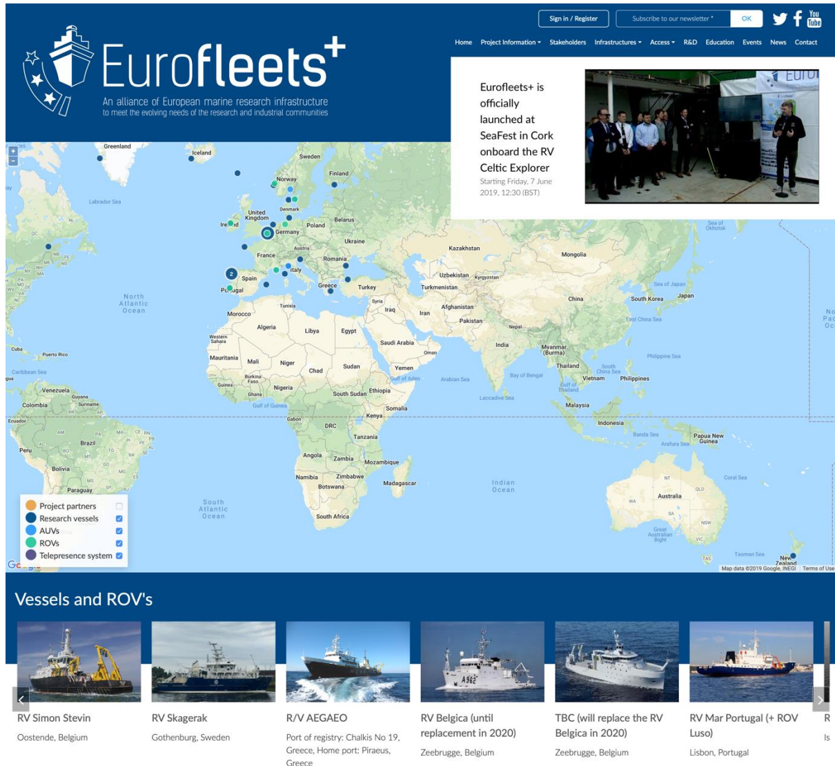
Figure 2. Screenshot showing the official launch of the Eurofleets+ project streaming live onto the project website.

The official project launch was streamed live via the project website (figures 2 and 3).