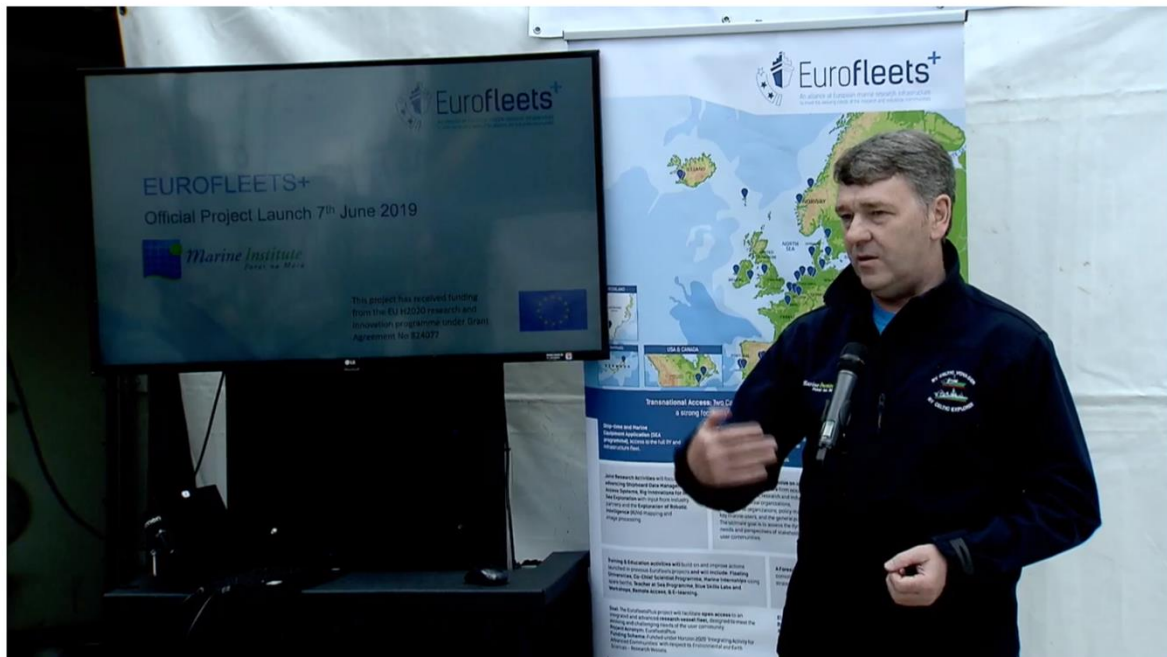
Eurofleets+ is officially launched at SeaFest in Cork onboard the RV Celtic Explorer